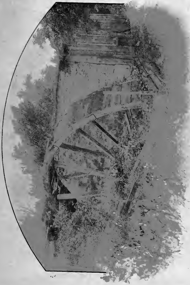
* * * The ancient mill Sent out its song, a crooning soft and low,